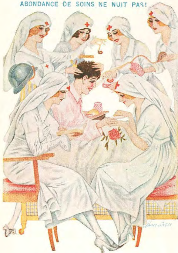
ME in the hospital at Angicourt